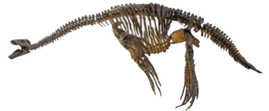
fossilised Plesiosaur skeleton

Mary Anning (1799–1847) was an English fossil collector. She lived in Lyme Regis in Dorset, in an area now known as the Jurassic Coast. Mary had little formal education but was taught fossil hunting by her father. She made many important fossil discoveries during her lifetime, including an Ichthyosaurus fossil in 1811 and a fossilised Plesiosaur in 1823.